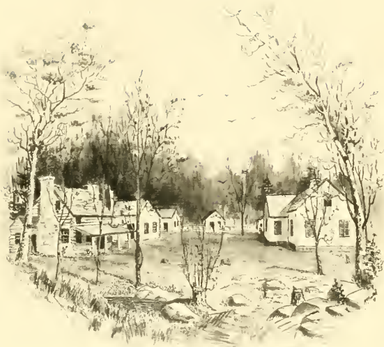
The Home of John Randolph